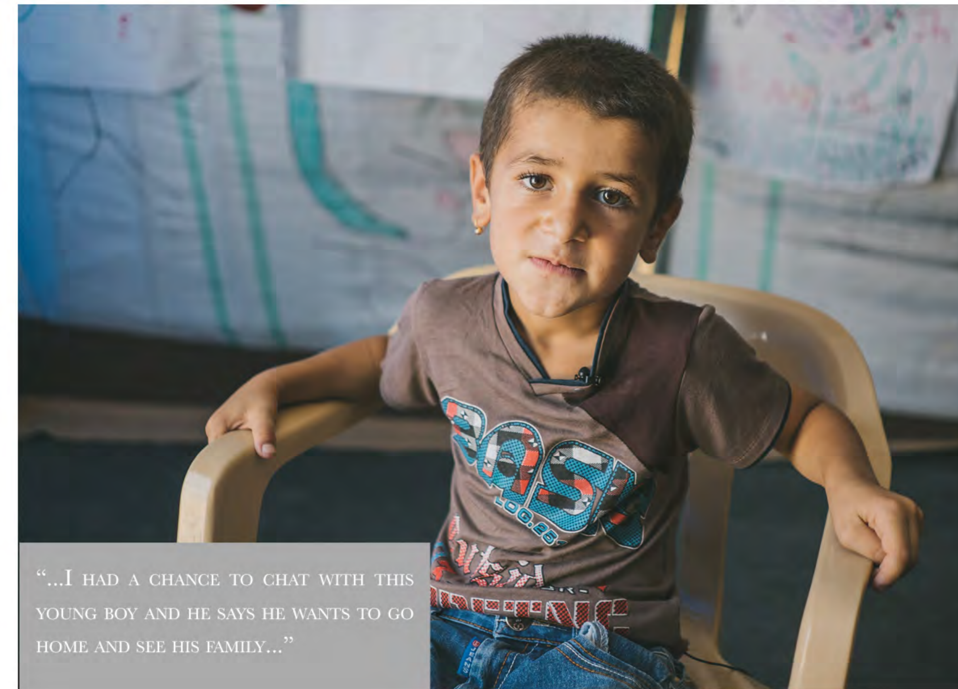
"...I HAD A CHANCE TO CHAT WITH THIS YOUNG BOY AND HE SAYS HE WANTS TO GO HOME AND SEE HIS FAMILY..."

4 MILLION IRAQIS WERE DISPLACED, INCLUDING ALMOST 2 MILLION CHILDREN. AFTER 2006 THE TOTAL NUMBER OF INTERNALLY DISPLACED PEOPLES (IDPS) IN THE COUNTRY WAS ONE OF THE HIGHEST IN THE WORLD, AT 2.7 MILLION AND 1.7 MILLION REFUGEES WERE STRANDED IN NEIGHBOURING COUNTRIES, MAINLY SYRIA AND JORDAN. INTERNALLY DISPLACED CHILDREN ARE PARTICULARLY VULNERABLE. THEY ARE OFTEN VICTIMS OF CRIME, EXPLOITATION AND ABDUCTION. ACCORDING TO AN UNHCR REPORT, 2009, 20% OF INTERNALLY DISPLACED AND 5% OF RETURNEE FAMILIES REPORTED CASES OF MISSING CHILDREN. THIS AMOUNTED TO AROUND 93 500 CHILDREN WHO HAD DISAPPEARED AS A RESULT OF VIOLENCE, KIDNAPPING, ABDUCTION OR FORCED RECRUITMENT BY ARMED FORCES.